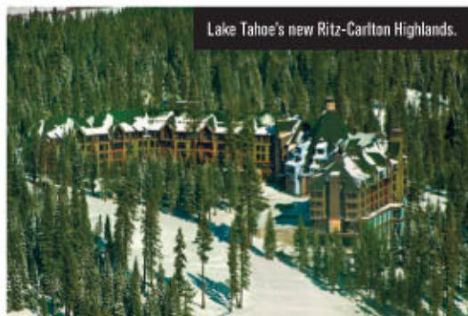
Lake Tahoe's new Ritz-Carlton Highlands.