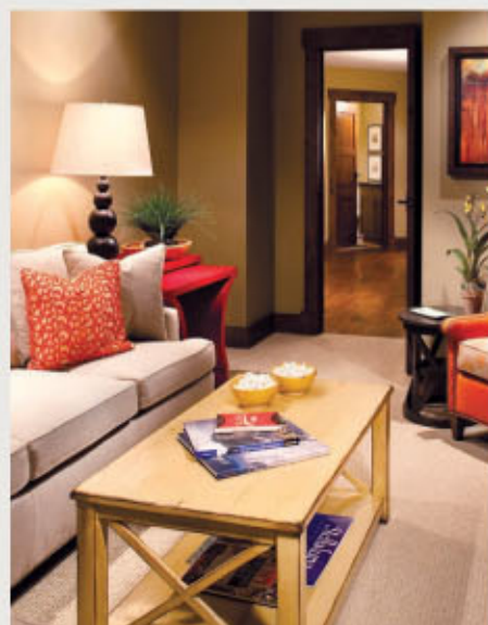
The aesthetic is rustic yet refined at new One Steamboat Place.

Perhaps all the town was lacking was a five-star luxury residence. Well, when it rains, it pours: Known for its collection of destinations nonpareil, Timbers Resorts is putting the finishing touches on One Steamboat Place , an 80-residence ski-in/ski-out resort opening in January. With fractional ownership starting at $370,000 and whole ownership at $3 million, the three- and four-bedroom residences are spectacular: Re-purposed wood and hand-cut stone lend them a sturdy timelessness, while amenities like steam showers and heated floors are decidedly non-rustic. Owners enjoy a market, new restaurant, spa and access to a golf course. They'll also be able to swap residences with other Timbers