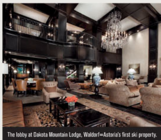
The lobby at Dakota Mountain Lodge, Waldorf=Astoria's first ski property.

After hitting the Canyons, Park City or Deer Valley ski areas, head to lobbyside restaurant Spruce , the first outpost of the acclaimed San Fran restaurant, where local ingredients rule and the carrot-Marcona almond soup is a must. On par is downtown Park City restaurant 350 Main (350 Main St., 435.649.3140), a mecca of globally inspired, healthy cuisine; or true adventurers can head up to the Canyons' 8,300-foot-elevation Lookout Cabin (lunch only; on Lookout Peak at the top of the Golden Eagle and Short Cut lifts; 435.615.2892), acclaimed for its wine list and only accessible to skiers. Back at the hotel, slide into Dakota's Golden Door Spa , one of just six in the world, for spa director Sharon Ogawa's foot treatments, designed to pamper your tootsies after a day in ski boots. PEAK PERFORMANCE! Board Dakota's Frostwood Gondola to reach the Canyons, Utah's largest ski and snowboard resort. Nearly half of the 3,700 skiable acres are Black Diamond level. dmlparkcity.com . —Marissa Conrad